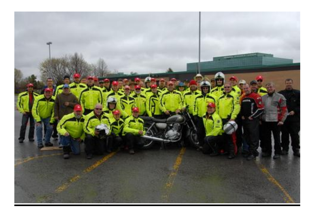
Motorcycle Instructors 2012

These goals are on track and will be carried over to 2013.